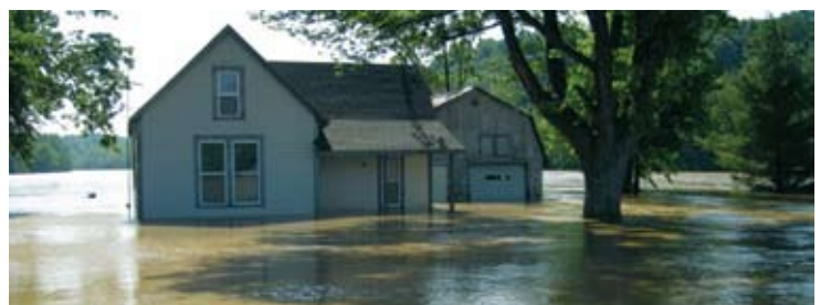
A home that was inundated by the floods.