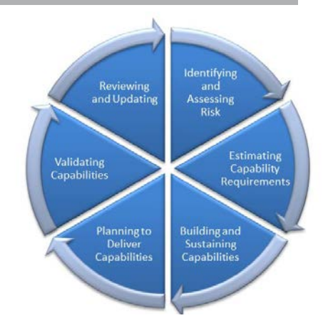
Figure 1: Mission Area Components of the National Preparedness System

Capabilities are the means to accomplish a mission, function, or objective based on the performance of related tasks, under specified conditions, to target levels of performance. The most essential of these capabilities are the core capabilities identified in the National Preparedness Goal. Complex and far-reaching threats and hazards require the whole community to integrate preparedness efforts in order to build, sustain, and deliver the core capabilities and achieve the desired outcomes identified in the National Preparedness Goal. The components of the National Preparedness System provide a consistent and reliable approach to support decision making, resource allocation, and measure progress toward these outcomes. The maturation and use of the National Incident Management System (NIMS) will aid in ensuring a unified approach across all mission areas as the National Preparedness System is implemented.