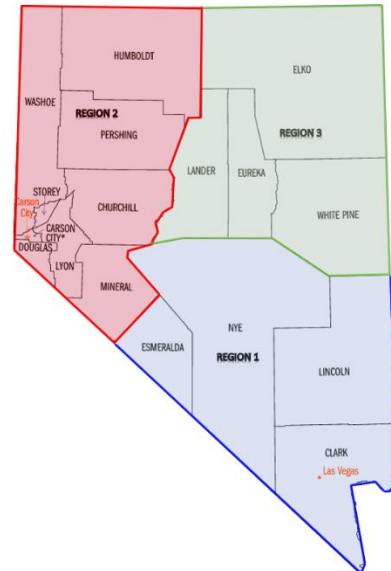
NEVADA REGION MAP

INCIDENT DESCRIPTION: The Nevada Operations Center (NVOC) is partially activated per the Division of Emergency Management (DEM) Spring Thaw Plan. The purpose of this activation is to increase our efforts for monitoring, preparedness, and supporting any jurisdictions in responding to flooding impacts.