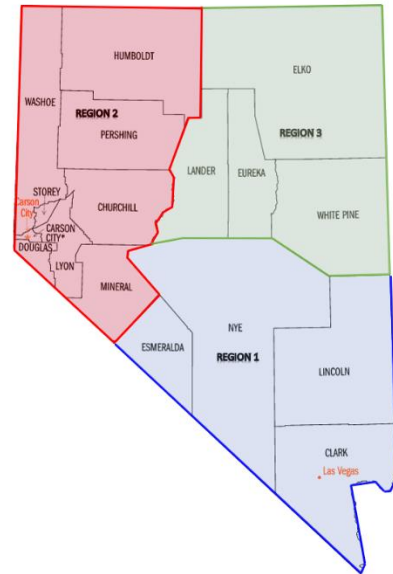
NEVADA REGION MAP

SOURCE: Nevada Division of Emergency Management (DEM), Nevada Department of Transportation (NDOT), Walker River Irrigation District, NV Energy, Nevada Department of Wildlife (NDOW), Lyon County Office of Emergency Management, and National Weather Service (NWS) Reno.