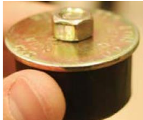
Figure 18. Marine/automotive plug.