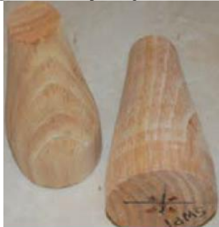
Figure 5. Pressure plug.

Conical-shaped rubber or wooden plugs can be used to plug drains. These plugs will be smaller in diameter than the pipe to be plugged on one end and larger than the pipe on the other end. The plugs are forced into the pipe and may need to be braced to prevent pressure from pushing them out. (Figure 5)