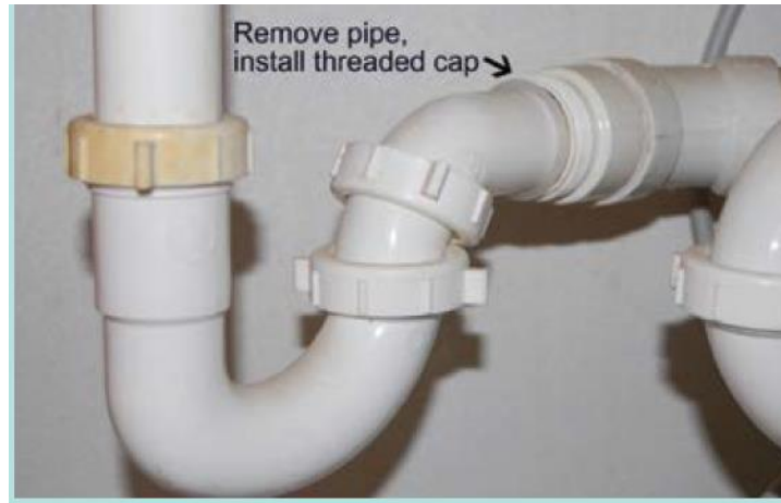
Figure 16. P trap under sink.