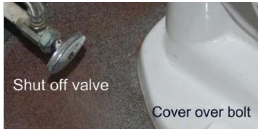
Figure 12. Toilet.

Basement toilets in potential flooding areas should be removed and the drainpipe should be plugged. Follow these steps to plug toilet drains: (Figure 12)