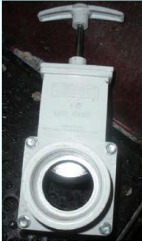
Figure 2. Knife valve.

A backwater valve can be installed in an existing home. Have a licensed contractor install an interior or exterior backwater check valve in your sewage system. If you do not have a backwater valve, plugs with backflow devices can be installed in floor drains. These plugs have a ball or float that will stop water or sewage from backing up into a home while permitting water to flow into the drain. These plugs can be left in place year-round.