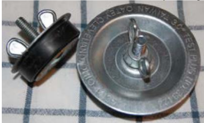
Figure 4. Twist plug.

The twist plug is inserted into the pipe and the wing nut twisted until the plug is tight. Twist plugs come in a variety of sizes and work well with floor, shower, and toilet drains. They can be plastic or metal. (Figure 4)