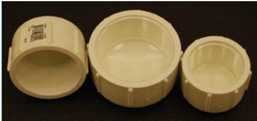
Figure 9. Threaded caps.

The plumbing fixture is removed, and the correct size threaded cap is installed on the pipe. (Figure 9)