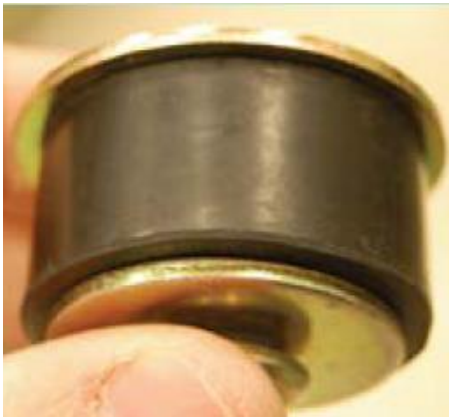
Figure 17. Marine/automotive plug.

To plug the overflow, remove the overflow cover and install a properly sized drain plug. You may need to purchase an automotive or marine plug since the overflow drain is shallow. (Figure 17, 18)