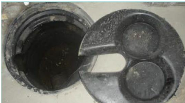
Figure 19. Footing drain.

A potential area for problems and leaking could be backflow from the sewer pipe collecting water from the footing drain. Some older homes have footing drains that lead to the sewer system. (Figure 19)