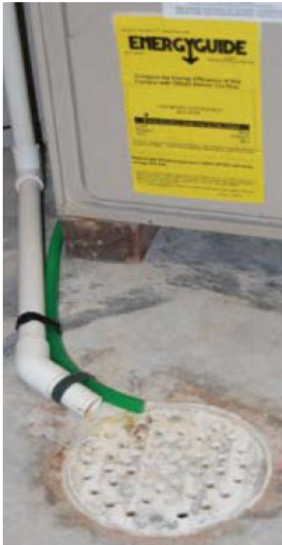
Figure 10. Floor drain.

Test balls, twist plugs or pressure plugs can be installed to seal floor drains but will not let water flow in either direction. If plugs are not available, a flexible rubber ball that is just larger than the pipe diameter can be used in an emergency but will need to be braced in place.