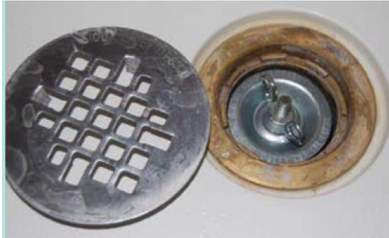
Figure 14. Plugging shower drain.

Shower drains come in a variety of types and sizes, so plugging them depends on the specific type. If the shower drain grate can be removed, simply place a proper sized drain plug into the drainpipe and tighten until snug. Some shower drain grates are not removed easily, so the drain needs to be covered with a material that will prevent sewage from leaking in if a backup occurs. These drains can be covered as described above with a thick piece of rubber or inner tube and then secured with a board or plywood. The seal needs to be held in place using the method described for bracing floor drain seals. (Figure 14)