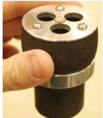
Figure 6. Floating backflow valve. Figure 7. Floating backflow valve. Figure 8. Floating backflow valve.