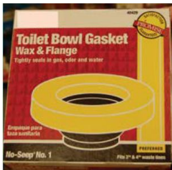
Figure 13. Wax ring.