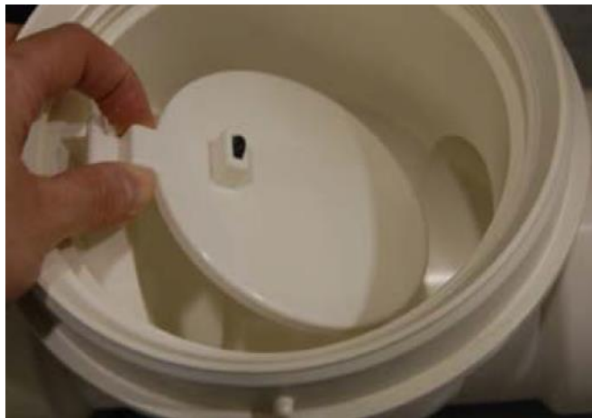
Figure 1. Backwater check valve.

Many new homes are constructed with backflow or backwater check valves in the main sewer line that reduce the potential for sewage backup into the home. The check valves contain a flapper that allows flow in only one direction. Check valves should be inspected annually to make sure they are free of debris and working properly. If your home has a backwater check valve, the point to access it usually is found in the floor near the main sewage cleanout. (Figure 1)