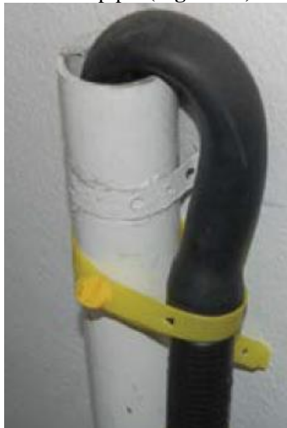
Figure 15. Washing machine drain hose.

Washing machine drains can be plugged by removing the washing machine drain hose from the drainpipe and then placing the correct diameter plug in the drain pipe. (Figure 15)