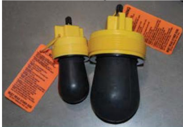
Figure 3. Test ball.

Test balls conventionally are used for pressure testing plumbing systems but can be used in emergency situations to seal drains. The ball is inserted into the pipe and inflated with air to the prescribed air pressure. Once inflated, the ball will not allow water to flow in either direction. (Figure 3)